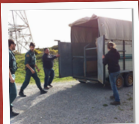
LOCAL GUARDIA CIVIL HELP