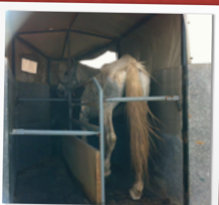
SAFELY ON BOARD